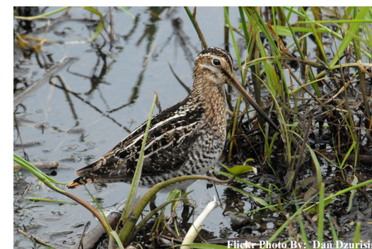
Wilson's snipe probably visited salt and freshwater marshes around the lake.