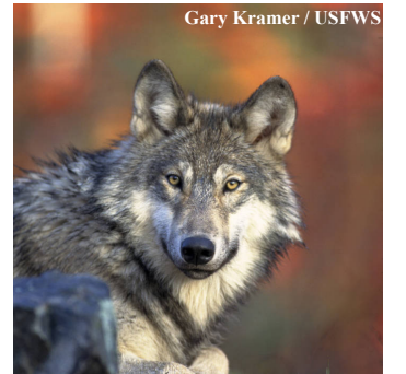
Gary Kramer / USFWS

In the uplands there were also extensive, diverse forests that included beech, chestnut, oak, basswood, and elm. The Onondagas harvested food from trees like sugar maple and butternut.