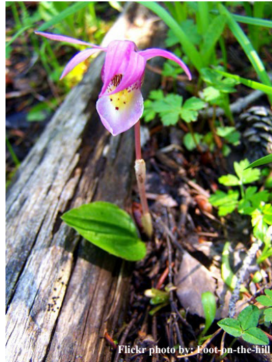
Fairy Slipper, a native orchid

Nineteenth century botanists who visited the Onondaga Lake cedar swamps reported finding abundant ferns and many rare plant species, including native orchids.