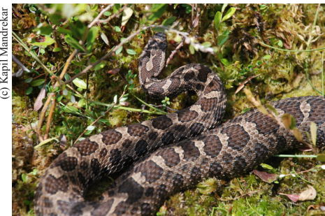
Eastern massasauga rattlesnakes, which were found around the salt springs, were used by the Onondagas for both food and medicine.

Relatively few plant species can survive in salty soils. Historical records tell us that the inland salt marshes around Onondaga Lake included plants such as saltmeadow rush, salt marsh sandspurry, and glasswort or samphire. It is common for inland salt marshes to have areas with no plant growth, either because the soil is too salty for plants to survive or because the ground has been disturbed by animals that are seeking salt, an important part of their diet.