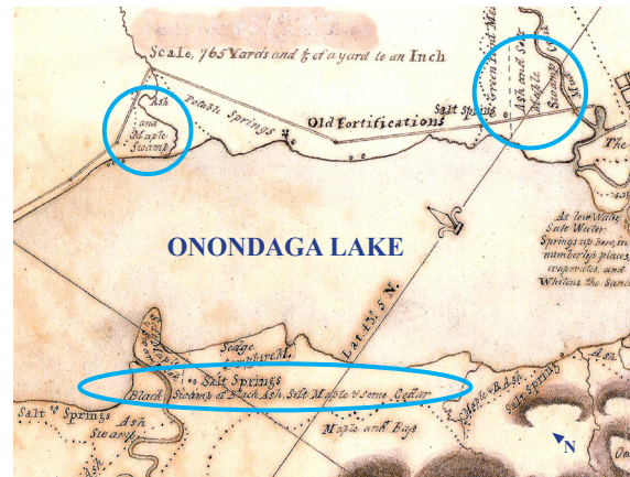
American Philosophical Society, Philadelphia PA

These wetlands were also home to a rich diversity of other plants such as northern spicebush, gooseberries, dogwoods and viburnum shrubs.