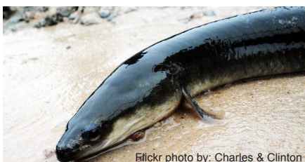
Current status: For most of the 20th century, the species was very rare in the lake. None were found in the lake between 2000 and 2009, although they have been caught in Onondaga Creek.