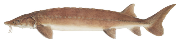
Current status: Today, lake sturgeon are threatened in New York and are rarely found in Onondaga Lake.

American eels are unique among the fish of New York because many of them are catadromous: they spawn in the ocean and then live most of their lives in freshwater. Young eels make an extraordinary journey from spawning grounds southeast of Bermuda in the Atlantic Ocean to inland freshwaters all over the Americas. After spending up to 25 years in freshwater, adult eels return to their ocean birthplace to spawn and die.