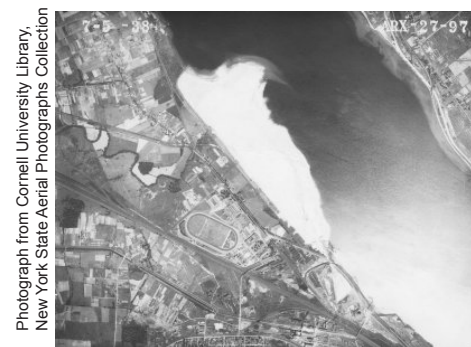
Industrial pollution on the southwestern shore of Onondaga Lake, 1938