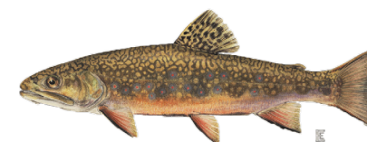
Current status: Today, brook trout are only found in the cold upper reaches of Onondaga Lake tributaries. Some of these fish have been stocked, but there is a small wild population still in existence.

They spawn between mid-October and early December in streams or shallow lake bays with gravel bottoms, usually close to springs.